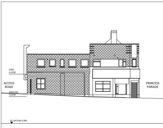
Existing side elevation