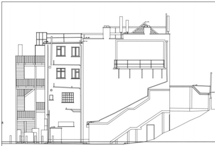
Existing side elevation